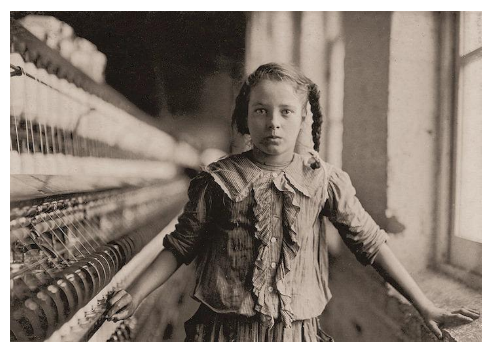
The Mill: One of the spinners in Whitnel Cotton Mill. She was 51 inches high. Has been in the mill one year. Sometimes works at night. Runs 4 sides - 48 cents a day. When asked how old she was, she hesitated, then said, "I don't remember," then added confidentially, "I'm not old enough to work, but do just the same." Out of 50 employees, there were ten children about her size. Whitnel, North Carolina.